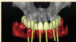
(תכנון והדפסה תלת ממדית לשיניים הזמניות)

בתכנון הקודם של הניתוח תוכננה צורת הכתרים הזמניים. אם פעם הרופא היה מתחיל לאלתר שיניים זמניות שבקושי התאימו, אזי בעזרת מדפסת תלת ממד מיוחדת מדפיסים את הכתרים הזמניים ע"פ התכנון.