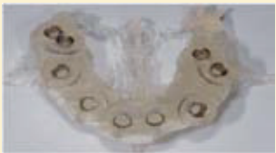
(תכנון וירטואלי של השתלים)